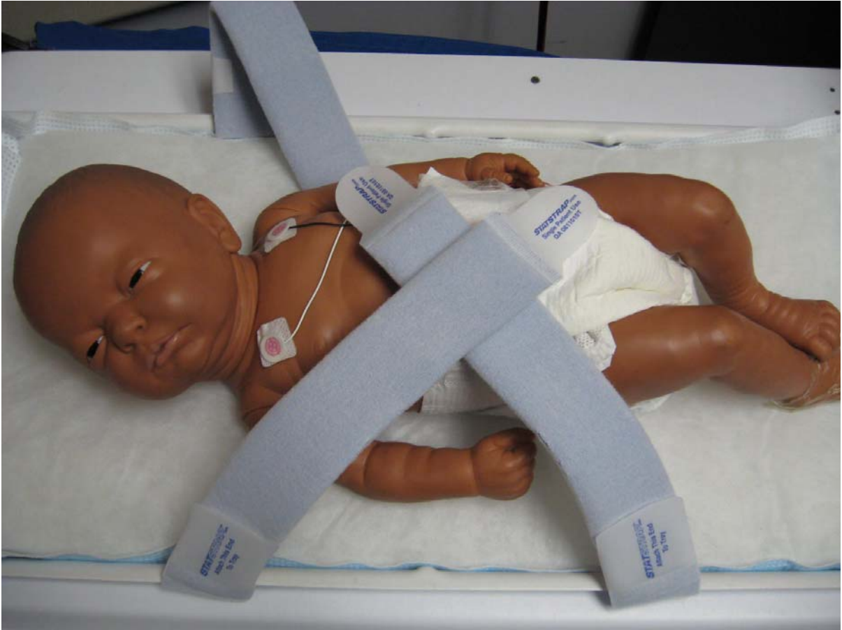
Front outside straps have two tabs each